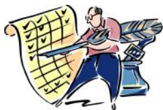
Attendance and Offering Report